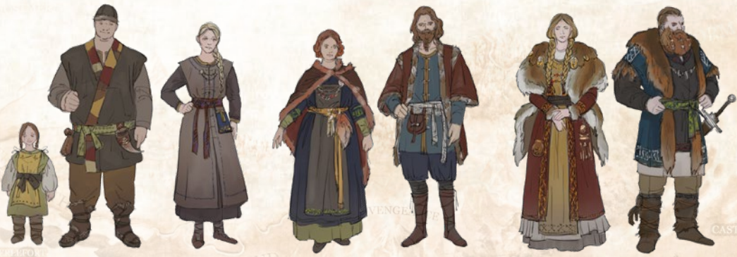
FASHIONS OF THE VALIKAN CLANS