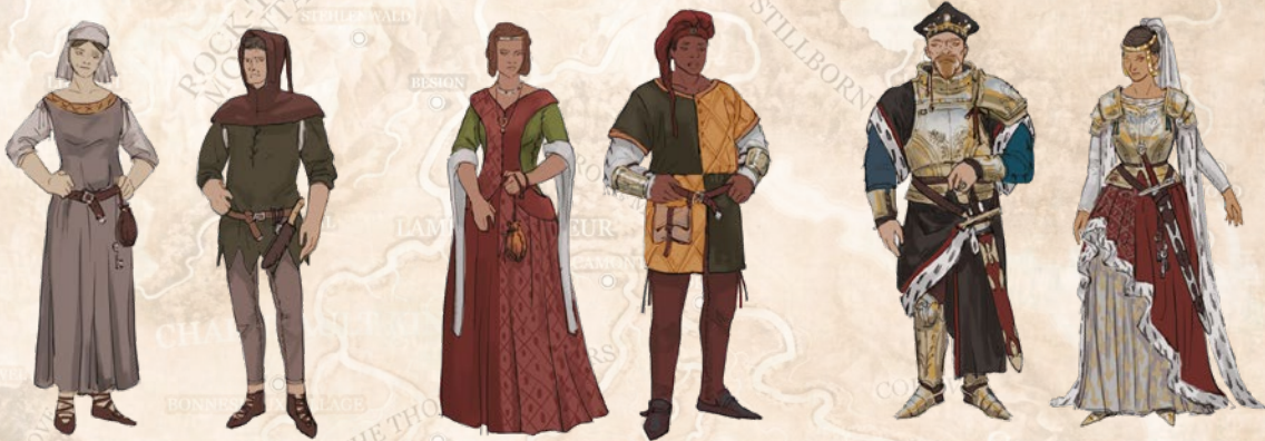
FASHIONS OF THE CHARNEAULT KINGDOMS