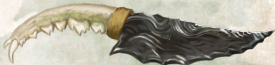
JAW KNIFE - WEAPONS CAN BE GRAFTED FROM ANYTHING

This glowing green liquid sends a creature's antibodies into a hyperactive state. When you drink this potion, you are immune to poison and disease for one hour. You also cannot contract curses like lycanthropy or mummy rot for the duration. At the end of the hour, you gain one level of exhaustion.