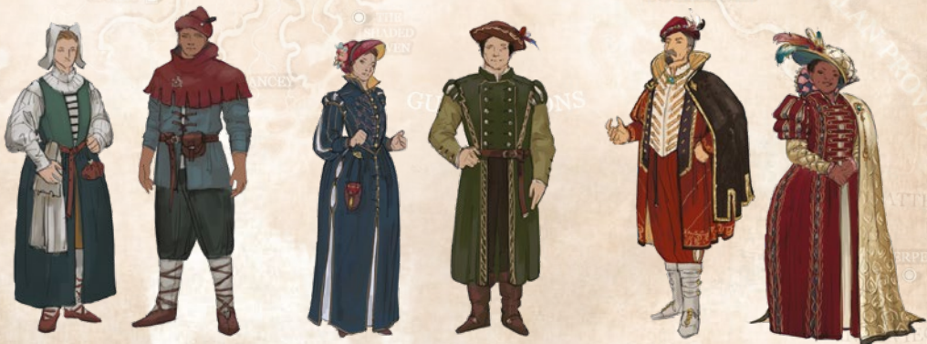
FASHIONS OF THE CASTINELLEN PROVINCES