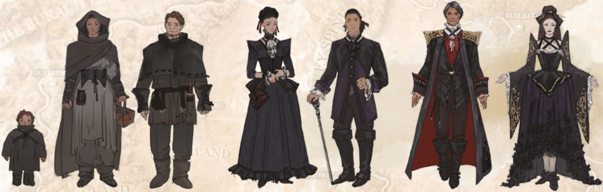
FASHIONS OF OSTOYA